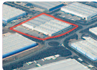
25 major occupiers on site