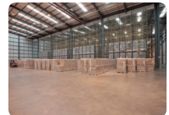
14.1m high bay